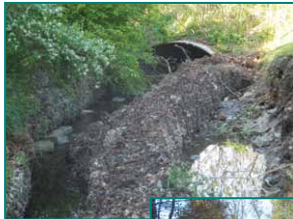
Sanitary and Storm Repair contractor removed and replaced gabion baskets on the east side of White Oak on both sides of the creek.