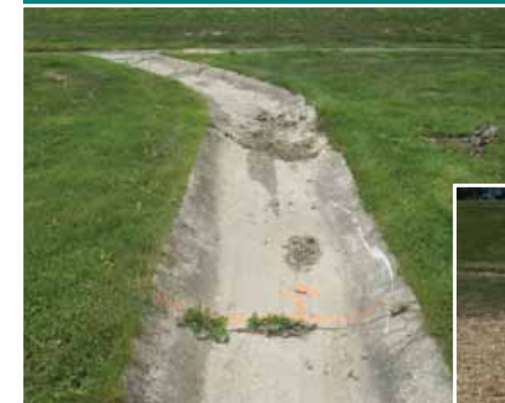
Replaced concrete channel at Fire Station #3