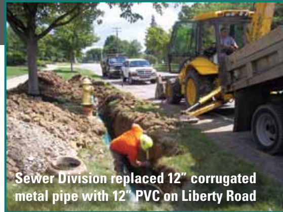
Sewer Division replaced 12" corrugated metal pipe with 12" PVC on Liberty Road