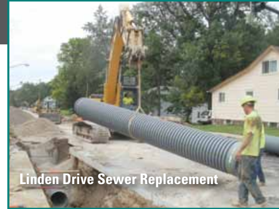
Linden Drive Sewer Replacement