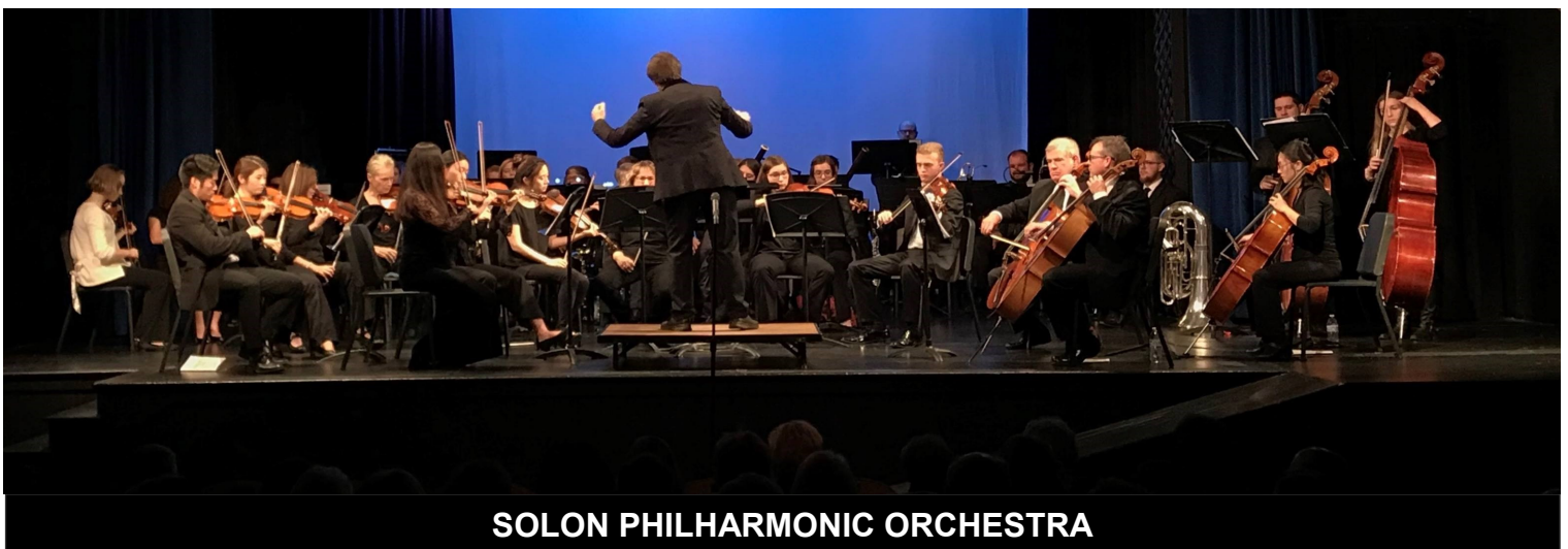
SOLON PHILHARMONIC ORCHESTRA